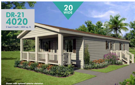
Example Home Exterior

Once the building plans are finalized and the funds are raised, the Crest Cottages will provide this safe, stable, and supportive program for as many as 16-24 participants at a time, giving each the opportunity to be pulled out of crisis and wrapped in a supportive and loving community of care.