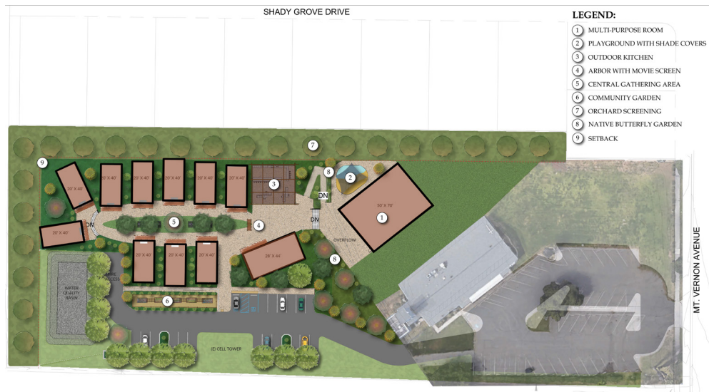
Conceptual Landscape Plan — Crest Cottages

Once the building plans are finalized and the funds are raised, the Crest Cottages will provide this safe, stable, and supportive program for as many as 16-24 participants at a time, giving each the opportunity to be pulled out of crisis and wrapped in a supportive and loving community of care.