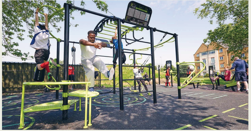
Conceptual Images of Crest Cottage Village